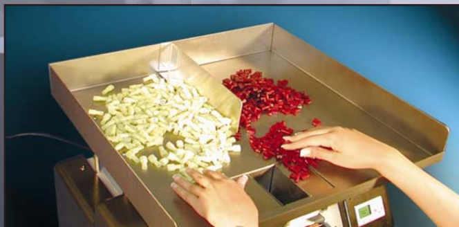
Optional Sorting Table