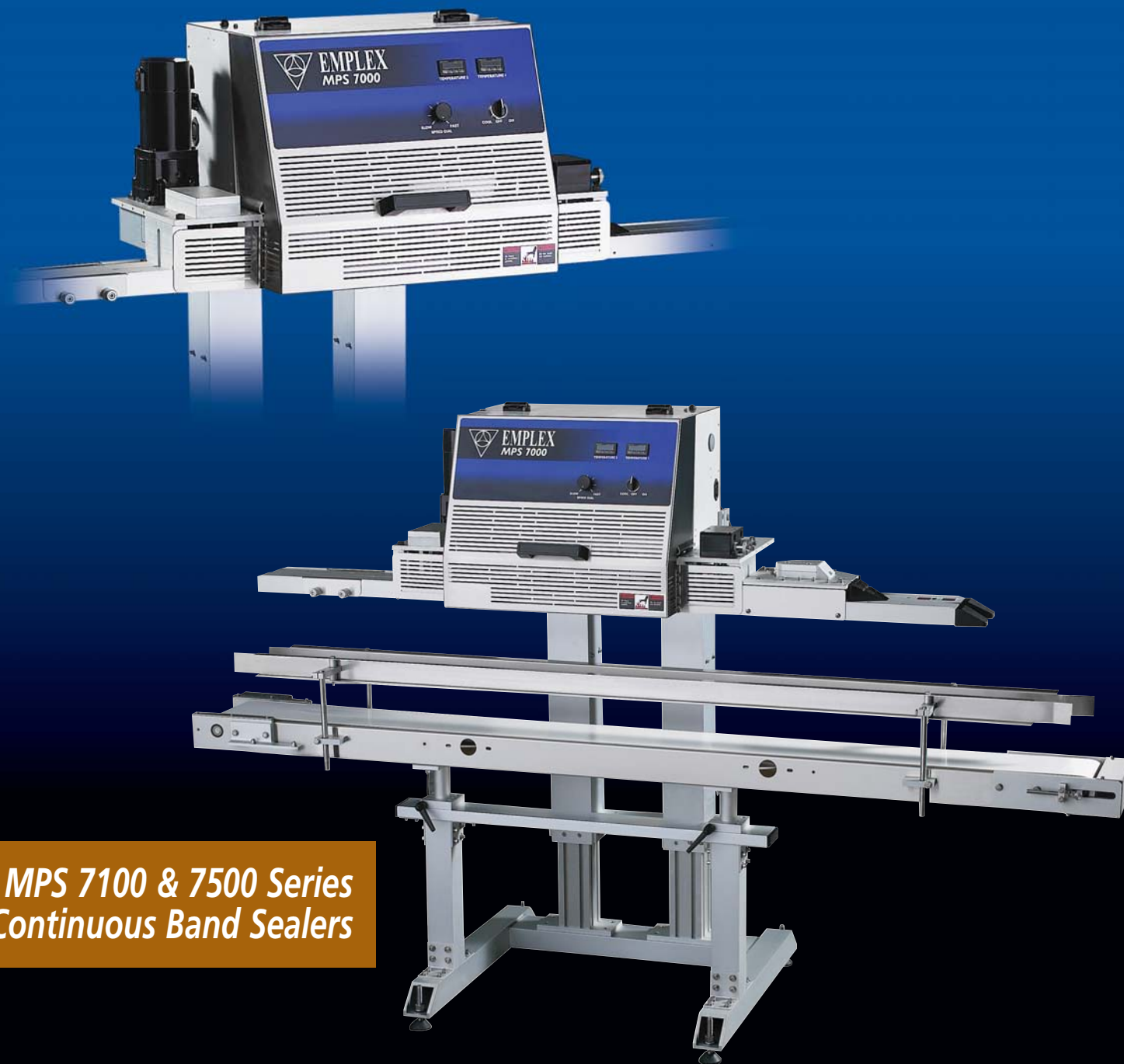
MPS 7100 & 7500 Series Continuous Band Sealers