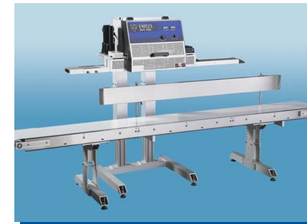
MPS 7500 with a 12" x 9' conveyor

The MPS 7500 series is the conveyORIZED mate to the 7100 Series, and is required for bag weights of 2 pounds or more. The conveyors are provided standard with an electrical drive connection. All conveyors are stainless steel, food-grade belt conveyors complete with adjustable guide rails and can be manually raised and lowered (see the dimensional drawing on the back page). Standard conveyor size is 6" W x 6' L (as pictured on the cover). An optional, fixed height 12" W x 6', 9', or 12' L conveyor is available as an upgrade.