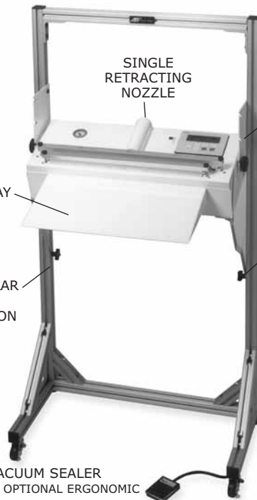
635 VACUUM SEALER SHOWN WITH OPTIONAL ERGONOMIC MULTI-POSITION ACCU-SEAL STAND