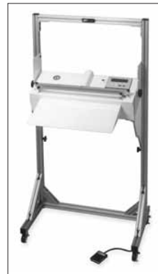
OPTIONAL ERGONOMIC MULTI-POSITION ACCU-SEAL STAND (SHOWN W/ MODEL 635-232)