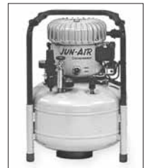
OPTIONAL ULTRA-QUIET LAB/OFFICE COMPRESSOR